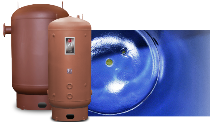
Inside view of commercial tank lined with Ultonium® + Microban®.