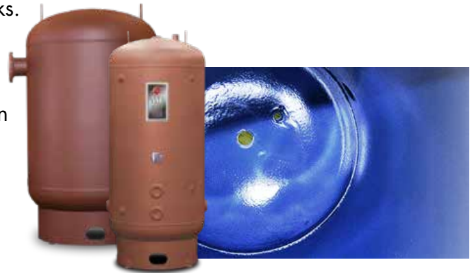
Inside view of commercial tank lined with Ultonium® + Microban®.